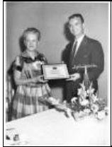
KGFX is awarded for it's 40 years in broadcasting, by United Press in 1956 .